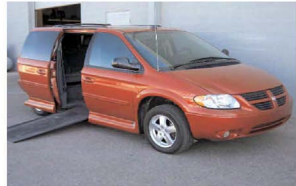
2005 Red Dodge Grand Caravan SXT. 21,000 miles. Grey cloth interior. VMI Northstar in-floor ramp. $42,000

"With the largest inventory in North America, our goal is to match each persons unique needs, personal preferences and budget with the ideal mobility product."