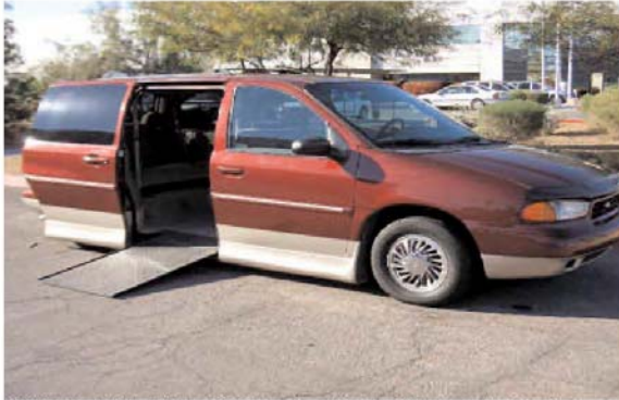
1998 Ford Windstar. 70,600 miles. Red with tan cloth interior. VMI Northstar in-floor ramp. $17,500

Serving Arizona residents for over 16 years!