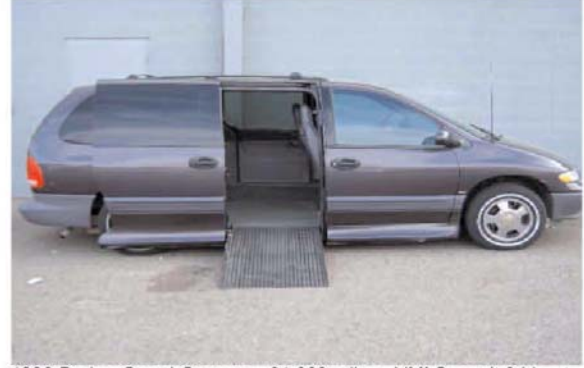
1996 Dodge Grand Caravan. 61,000 miles. VMI Summit fold-out ramp. $13,500