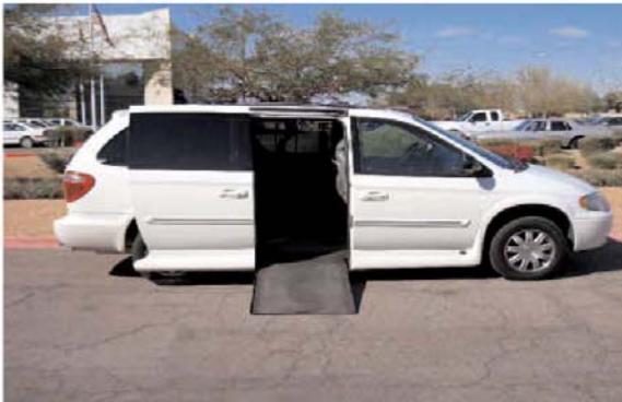
2005 White Chrysler Town & Country Touring. 14,000 miles. Leather interior with sun roof. VMI Northstar in-floor ramp. $45,350