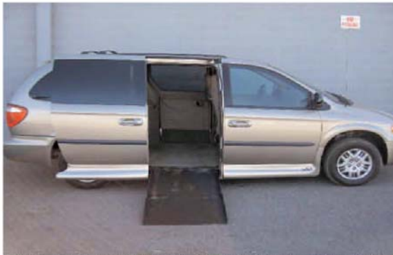
2002 Dodge Grand Caravan SE Sport. 53,000 miles. Linen Gold with Khaki cloth interior. VMI Summit fold-out ramp. $27,995