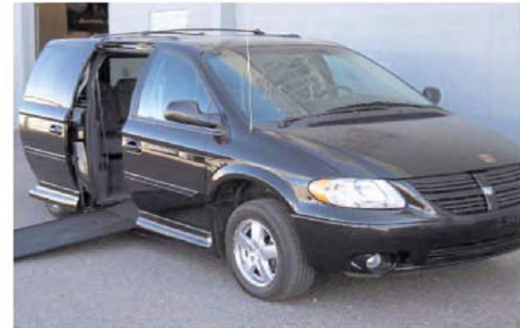
2005 Dodge Grand Caravan SXT. 22,300 miles. Grey cloth interior. VMI Northstar in-floor ramp. $38,500