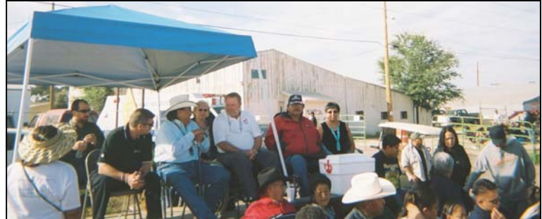
We all had fun at the 2007 Navajo Nation Fair.